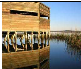
The hide from the front