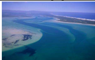
Aerial shot of the Lagoon

West Coast National Park is located up the Atlantic West Coast of South Africa, approximately an hour's drive north of Cape Town along the R27. The park is dominated by coastal strandveld and surrounds Langebaan Lagoon , a RAMSAR site of global importance for migratory wading birds. The park also includes coastal islands at the mouth of Saldanha Bay, where there are important breeding locations for several sea-birds such as penguins, gannets and cormorants. The western peninsula offers visitors views and access to the Atlantic Ocean at Tsaarsbank and the northern section of the peninsula is known as Postberg and is only open to the public at certain times of year when it is flower season. The northern section of the lagoon is a multi-functional section for most water sports, the central section is restricted to sail or paddle boats and angling is forbidden, while the southern section is the Wilderness section.