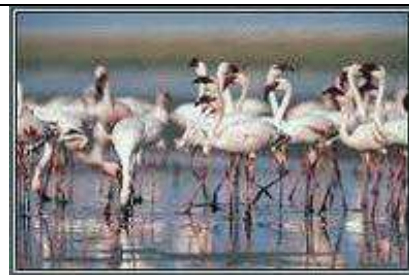
Flamingos are frequently present

There are other hides in the park at Seeberg, at Abrahamskraal, one in the salt marsh behind Geelbek and the second hide at Geelbek mentioned above. None of these are independently accessible in a wheelchair and some are plain inaccessible for reasons such as steps along the access route, crossing over difficult terrain or inappropriate layout inside the hide. Hopefully this situation will be addressed in future as it is not right that constructed facilities are not accessible to all visitors to the park.