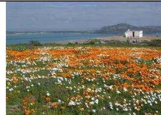
Flower Season in the Postberg Section

Visitors to the park can enter either from the Main Gate on the R27 or through the Langebaan Gate. At both locations visitors in wheelchairs can remain in their vehicles and the park staff will process the entrance through one's vehicle window. The multi-recreational and sailing sections of the park are not that accessible. Wheelchair users will need assistance to get onto any of the piers as they have steps. Most of the accommodation and facilities of the park are in the Wilderness Area and there are accessible facilities at Geelbek , Duinepos and Abrahamskraal .