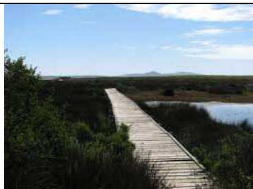
Start of the long boardwalk to the hide

Bird Hides: Another major attraction of West Coast NP is the birdlife and there are 2 hides at Geelbek, but only one is accessible in a wheelchair. This accessible hide is about 300m from the main building along the tar access road. There is then a short distance over open ground before one reaches a considerable boardwalk. This is because of the tidal nature of the lagoon and to cross over the fringing mudflats and pans. There is a small ridge at the start of the boardwalk; but once onto the boardwalk proper the surface should not pose many problems to a wheelchair user. Chairs with small front casters may have to watch the gap between planks in a few places, but the boardwalk has significant kick-plates along both its sides for the duration of the route, so there is never a danger of falling off. Once inside the hide the front section has no benches, so a person in a chair can approach right up to the viewing slot. However the viewing slots on the sides have fixed seating benches in front of them which means these slots are not as convenient to look out of. Another access challenge is that the viewing slots have wooden covers that users of the hide are supposed to close when they leave and no-one else is in the hide. If a wheelchair user is alone this will be a little difficult, particularly where the fixed benches prevent access to the slots.